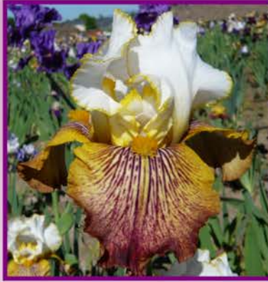
Offspring Tall Bearded - $50