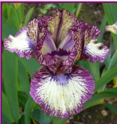
Behind Blue Eyes SDB - $20