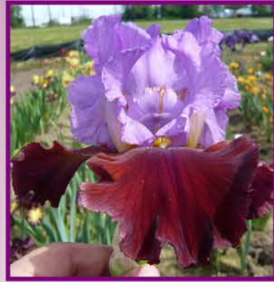
So Far So Good Tall Bearded - $50