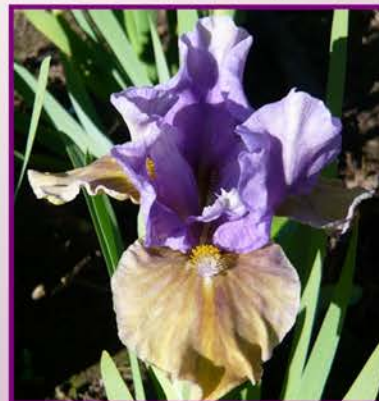
Tiny House SDB - $20