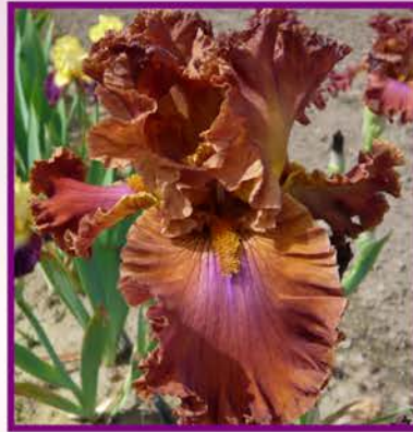
Working Class Hero Tall Bearded - $50