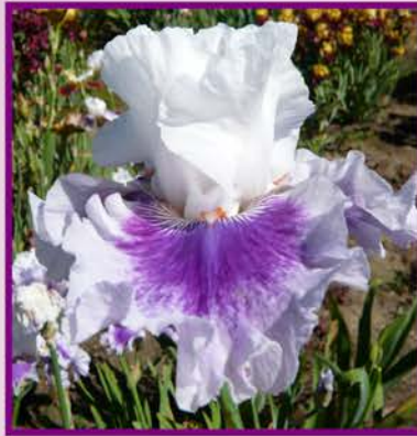
Tell Your Children Tall Bearded - $50