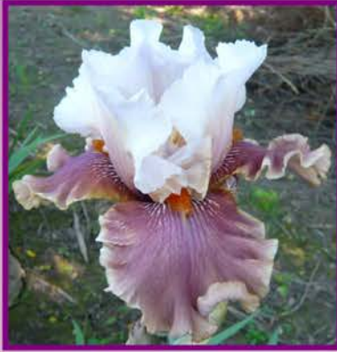
Better Man Tall Bearded - $50